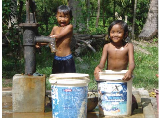
Enjoying a cool shower Cambodian styler